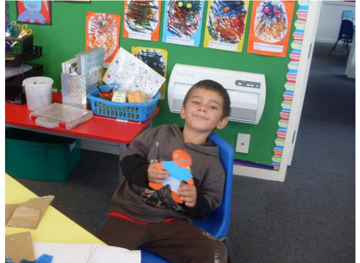
Discovery Time in Room 2 & 3 - Making Gingerbread Men and Making clothes for their Gingerbread men!